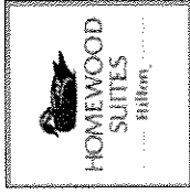
EXHIBIT "A" Page: 1 of 1